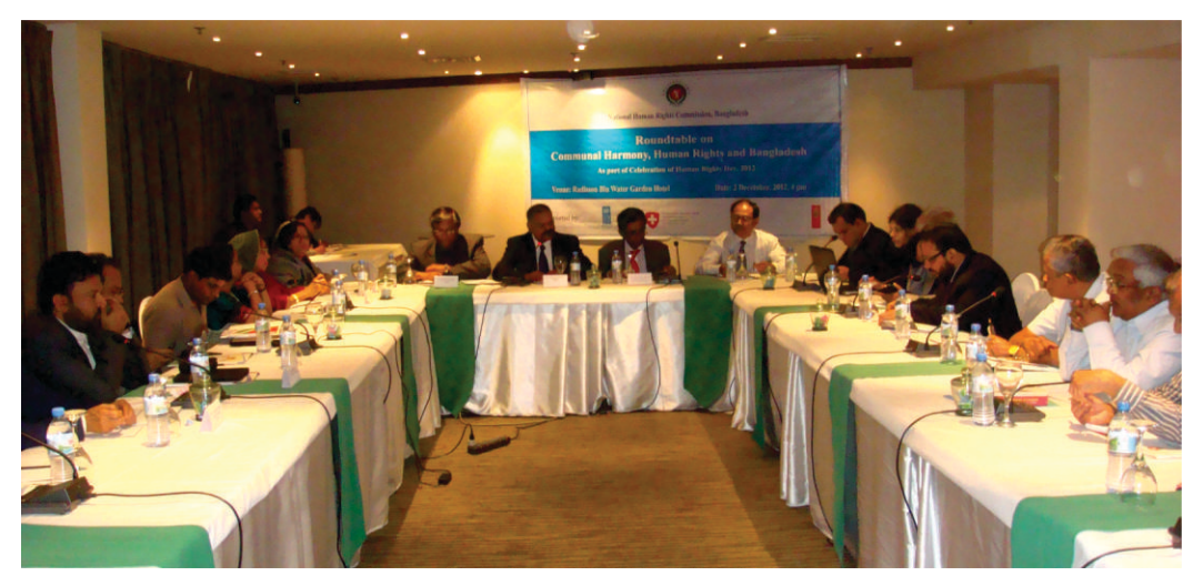
Roundtable on Communal Harmony and Human Rights.

In order to help prosecution of crimes against humanity by the International Crimes Tribunal Bangladesh (ICTB) and ensure due process of law in accordance with