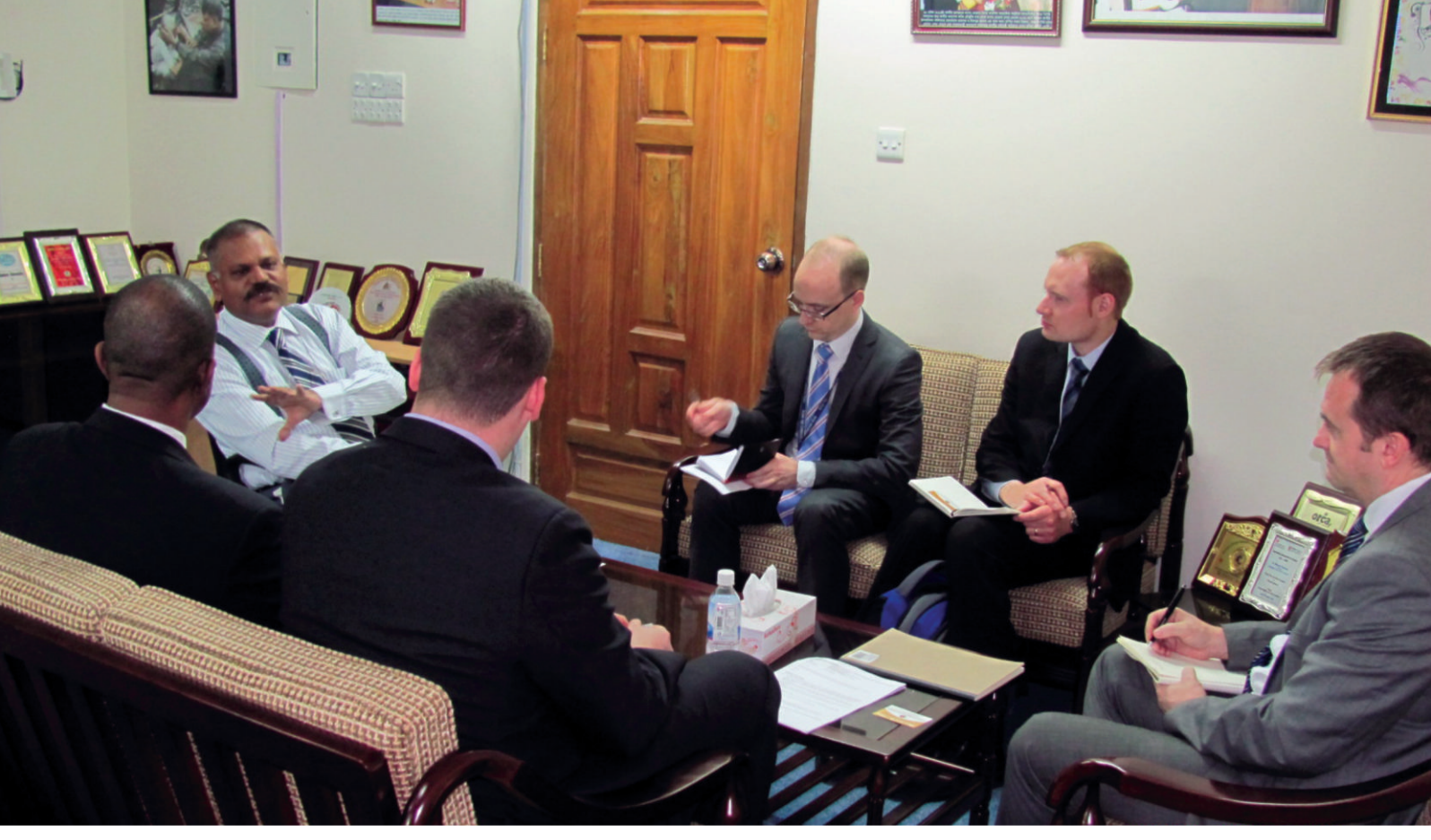
The delegation of UK Justice Sector at NHRC.

and civil society. Delegates from around the country attended. Feedback was incorporated into the final report of the NHRC recommendations (Annexure E).