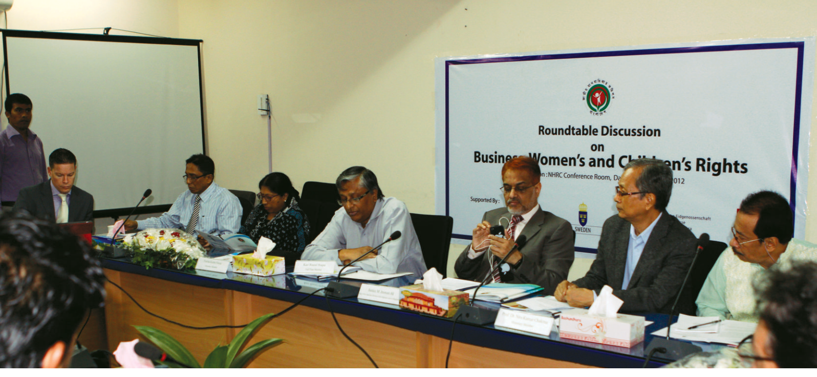
Dialogue on Business Women's and Children's Rights

This has enabled the Commission to exercise its legal mandate in overseeing any proposed or existing legal instruments through a human rights lens. The recommendations to be incorporated are: