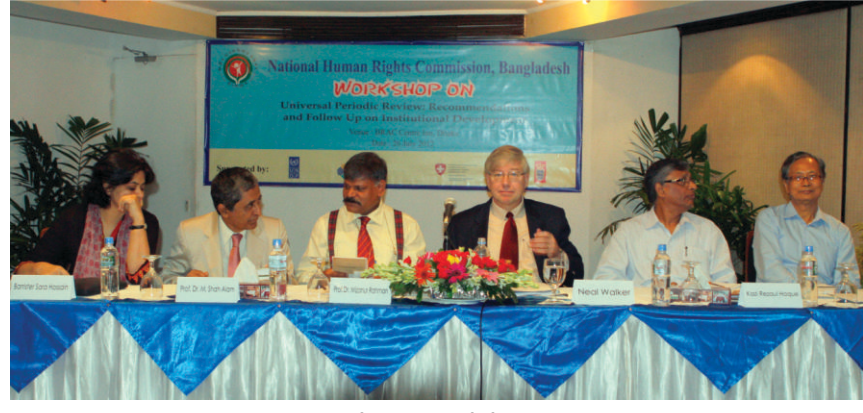
Consultation workshop on UPR, 2012.

The NHRC has completed recruitment of its officers and staff as per the approved organogram. Reasonably sound office facilities were created within relatively a short