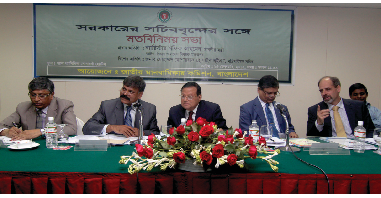
Dialogue with the Secretaries of Government.