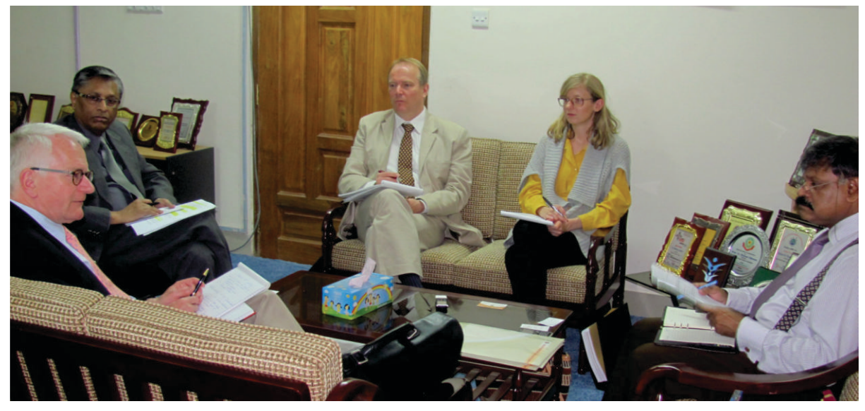
The delegation of Danish School of Human Rights at NHRC.

NHRC on different issues. As follow-up actions, the government has taken some steps that NHRC made as recommendations, particularly for a rehabilitation program for the people in the distressed communities ( Table 5 ).