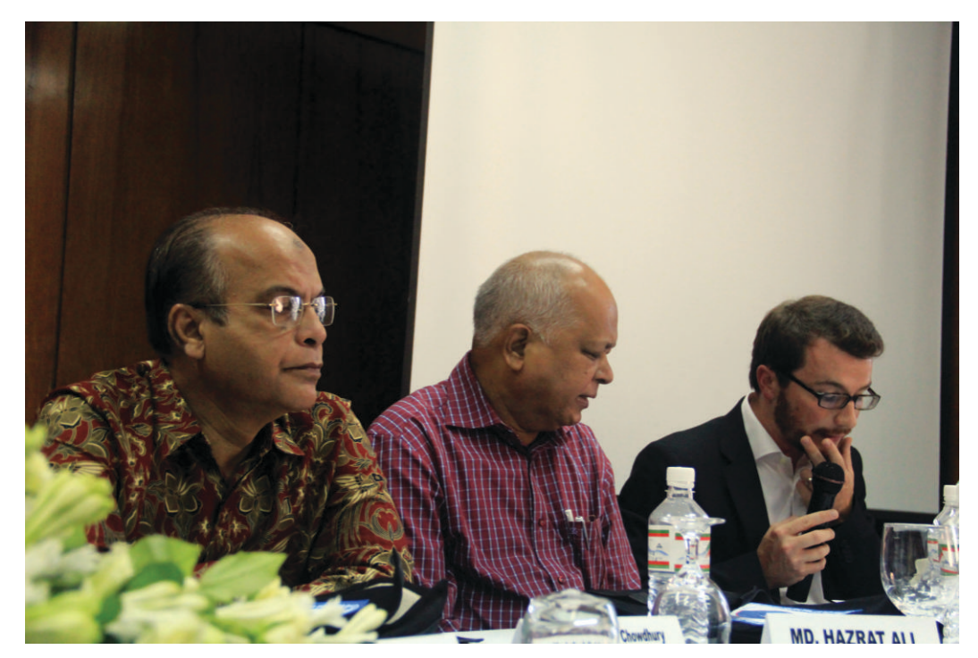
Distinguish participants in a seminar.

Rights Commission, inspected the unregistered refugee camp 'Lada Sight' and 'Make Shift' in Cox's Bazar. In the postinspection report, the picture of the living condition of the unlisted refugees and the absence of basic rights were portrayed. In this report, two major recommendations were made: