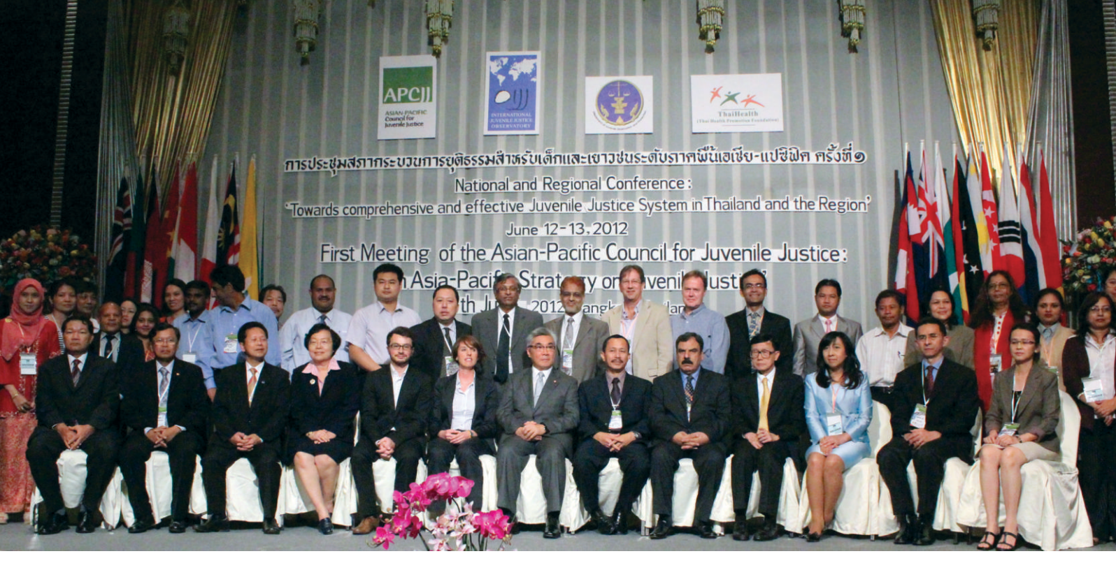
International exposure visit in Thailand.