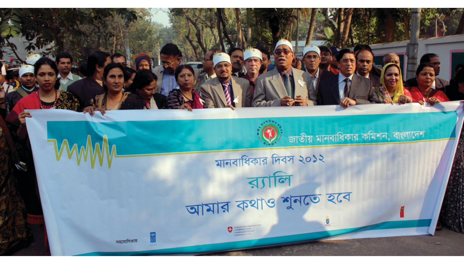
Celebration of Human Rights Day, 2012 in Khulna.

As part of these endeavours, a series of activities have been undertaken to disseminate knowledge and information among the stakeholders and the general public about the NHRC's existence, mandate, structure and functions and to promote widespread understanding of human rights.