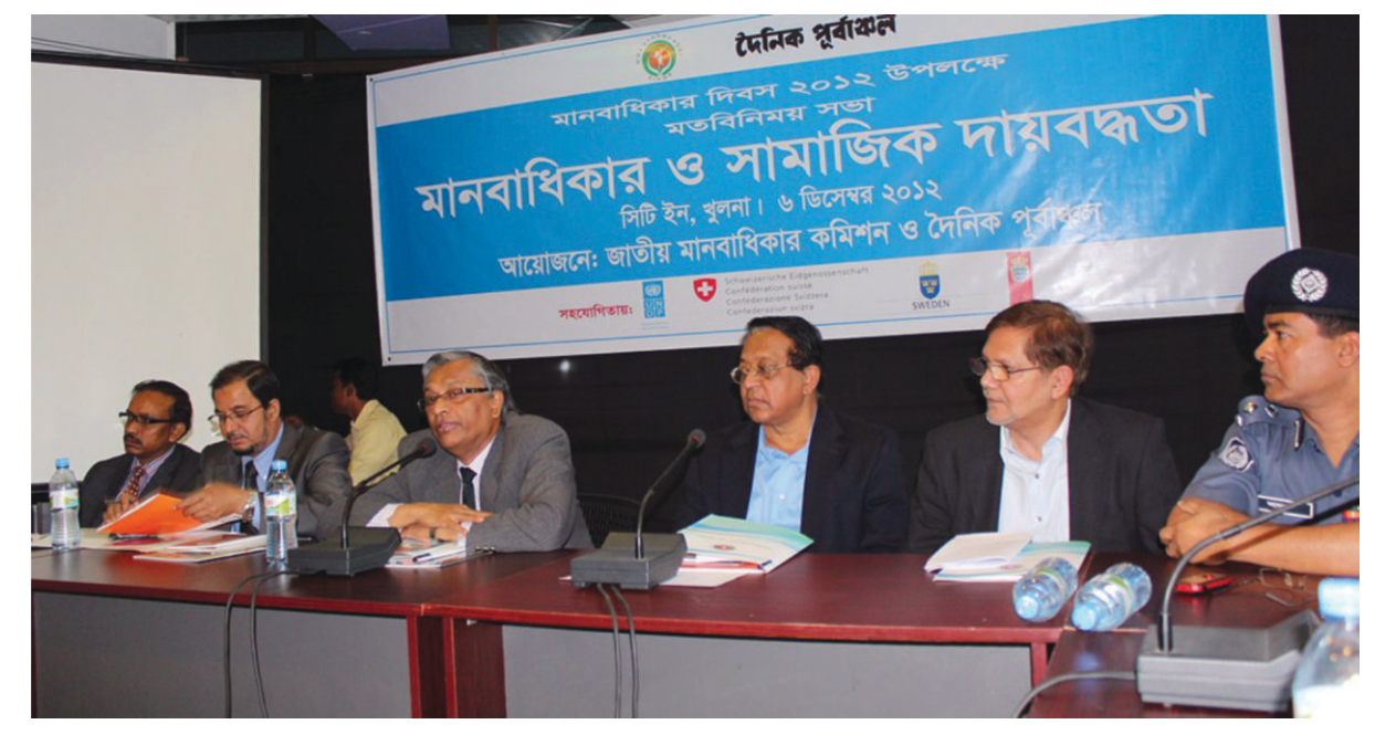
NHRC dialogue with media at Khulna.

eas of operations of the NHRC. To strengthen the institutional capacity a 3day retreat was organized with an international expert during the year. This contributed to the development of skills, effectiveness and efficiency of both the Members of the NHRC as well as the supporting officers and staff.