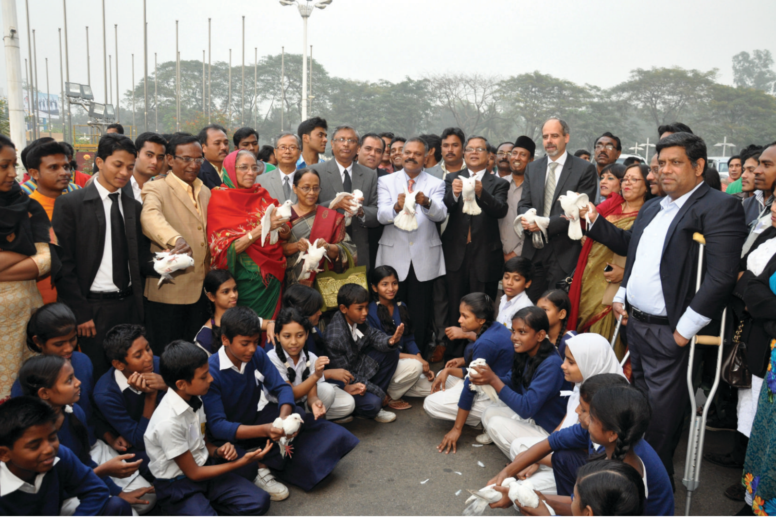
Celebration of Human Rights Day, 2012

mandated goal of raising awareness amongst people of all walks of life. The major areas of success include, among others, a Mass Awareness Campaign of Working Together for the Promotion of Human Rights, Awareness Creation on Child Rights and Juvenile Justice System, Violence against Women, Production and Dissemination of Video Documentation and Public Service Announcements (PSA), Installation of Billboards, the Brave Men Campaign, Human Rights Day Celebration on the 10th Dec 2012 at Dhaka, Chittagong and Khulna simultaneously, Round Table discussion with civil society groups in collaboration with media on communal harmony and the role of all actors in the compliance of safety, security and welfare of garment workers and Publication of Supplements, NHRC visibility in the Media and so on.