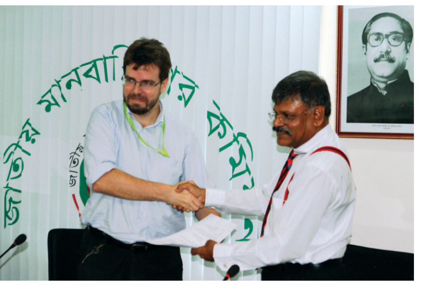
NHRC partnership with Oxfam.

eas of operations of the NHRC. To strengthen the institutional capacity a 3day retreat was organized with an international expert during the year. This contributed to the development of skills, effectiveness and efficiency of both the Members of the NHRC as well as the supporting officers and staff.